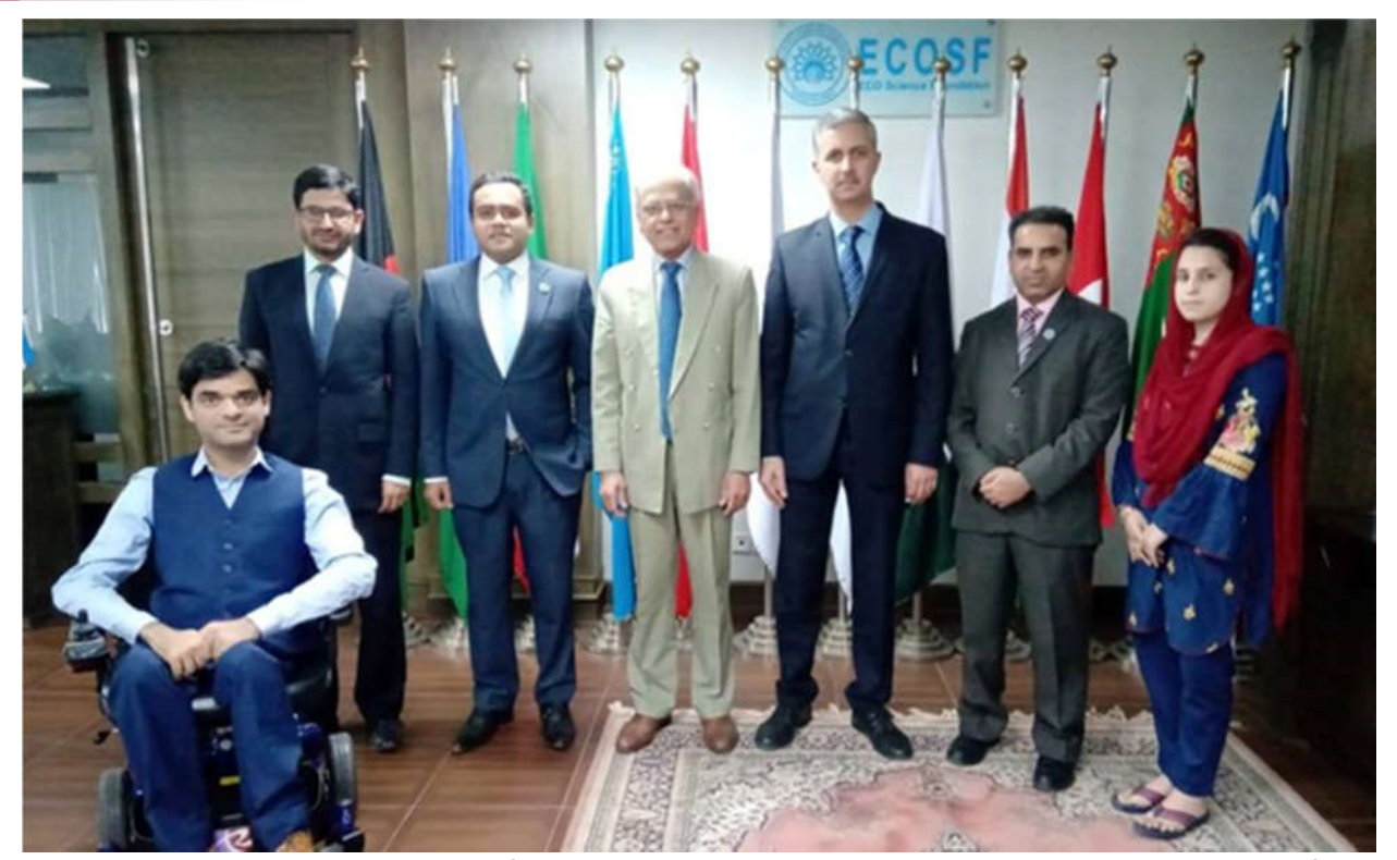
This year, 3rd teenager maker camp will be held from 24-30 September 2019 at Nanning China, wherein, the teams from 7 ECO countries viz., Azerbaijan, Iran, Kazakhstan, Pakistan, Tajikistan, Turkey and Uzbekistan will participate.

He further added that ECOSF, Academy of Engineering and Technology of the Developing World (AETDEW) Malaysia and Sugon Ruiyi Technology are partnering on Digital @ Belt and Road Double Hundred Universities Cooperation Program (DHUCP) under the Belt and Road initiative of China. So far, 12 universities from Afghanistan, Iran, Kazakhstan, Kyrgyzstan, Pakistan, Tajikistan and Turkey have joined in. Under this program, the capacity and capability of the universities will be enhanced in the fields of ICTs, Al and Big Data.